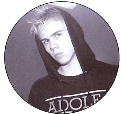
The Kid Laroi Indigenous Singer

"Be Smart, Stay Clean and Live the Dream".