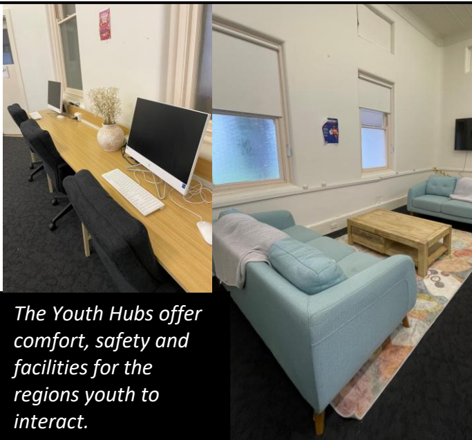
The Youth Hubs offer comfort, safety and facilities for the regions youth to interact.