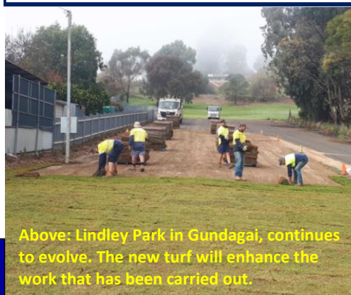
Above: Lindley Park in Gundagai, continues to evolve. The new turf will enhance the work that has been carried out.

COMPANION ANIMAL AUDIT: CGRC will be undertaking an audit of the NSW Companion Animal Register of cats and dogs over the coming 8-10 weeks that are currently unregistered. Microchip Identification and Lifetime Registration greatly assist the Council in returning your pet if they are lost, hurt, or stolen. Under the NSW Companion Animals Act 1998, cat and dog owners must undertake two steps to provide their pet with lifetime protection: 1. Permanent Microchip Identification and 2. Lifetime Registration. All pets in NSW, must be registered by 6 months of age, including all working dog. Registration fee is a one-off payment, paid at Council Offices and covers your pet for its lifetime, regardless of any changes in ownership. Owners are responsible for changing details when pets are sold or given away. If your pet has died, you must also notify the Council within 28 days of its death. For info, please contact CGRC Rangers on 1300 459 689. Information can be found at KEEPING COMPANION ANIMALS | Cootamundra Gundagai Regional Council (nsw.gov.au)