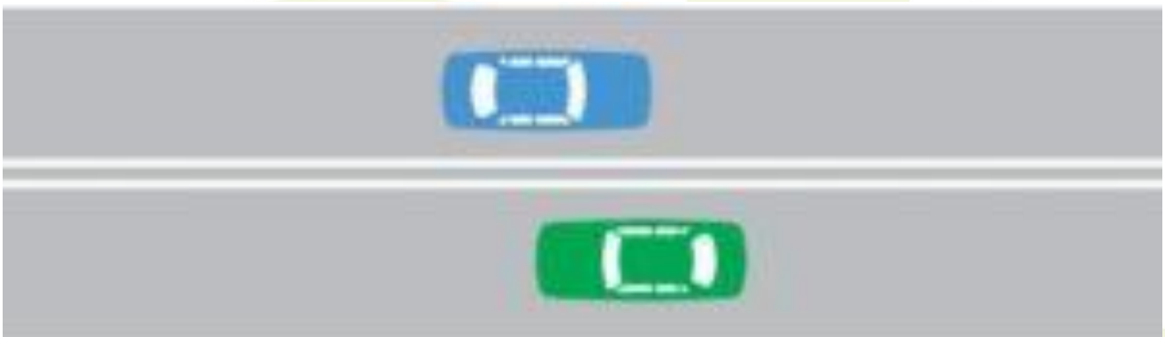
Road with double unbroken dividing line

You can cross double unbroken lines to enter or leave the road by the shortest route.