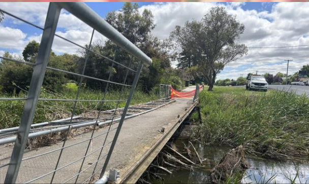
Above: Footbridges damaged in flooding event will be repaired, after funds from Resilience NSW have approved. The new bridges should be in operation by mid-June.

The cleaning of debris and fabrication of new handrails will commence soon, with construction, concreting and fencing works to commence early May. Completion time will be approximately four weeks. (Weather permitting).