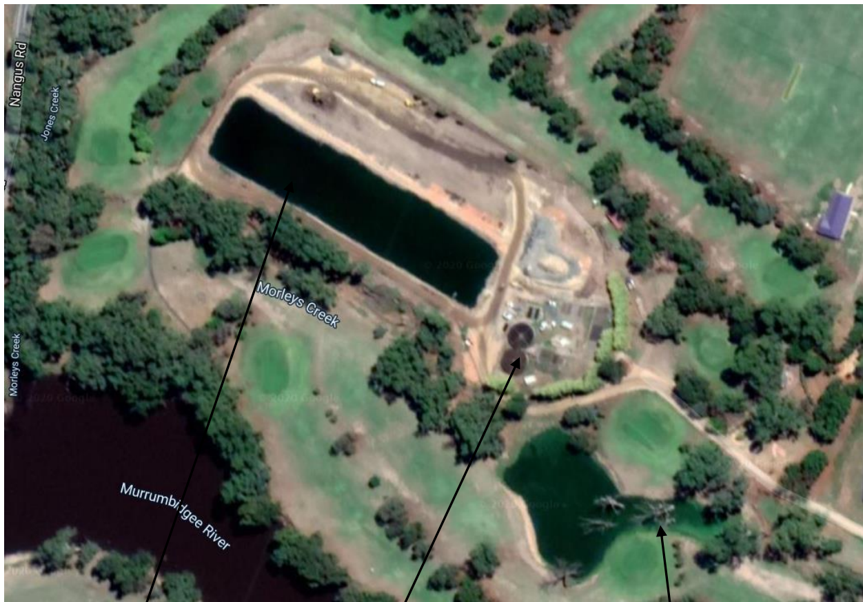
Figure 1- Layout of Gundagai Sewage Treatment Plant

The existing treatment plant consist inlet works, Imhoff tank and trickling filters, humus tank, maturation pond and sludge digester. Digested sludge is discharged into drying beds and disposed at landfill sites. Treated effluent is used to irrigate parks, sporting fields and golf course.