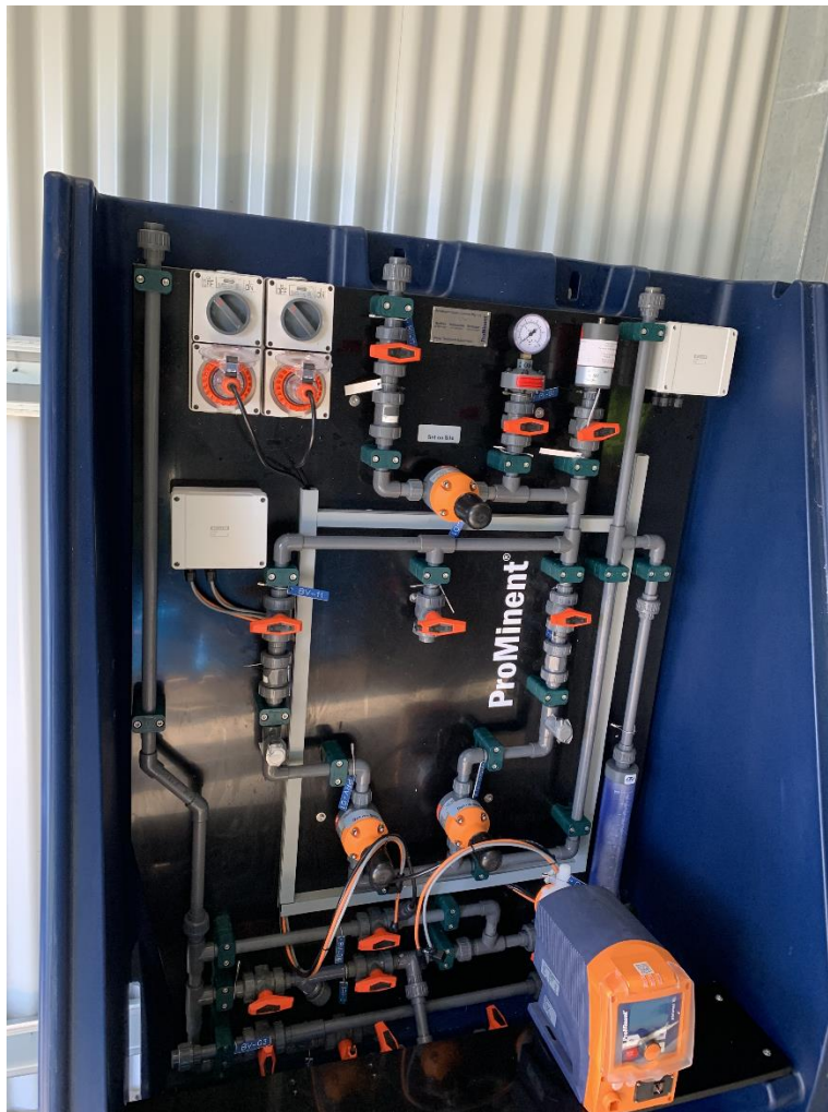
Figure 3 - Chlorinator

A skid Chlorinator using 12.5% hypochlorite solution was installed, tested and commissioned on 28 August 2020. Subsequent to this the coliform count in the irrigation point has dropped significantly representing an LRV of 3 and above achieved by the disinfection process. Further details can be found in the water quality report in Section 3 of this report.