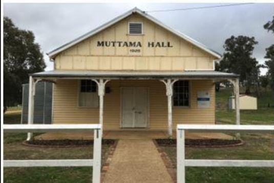
Morning tea will follow the ceremony.