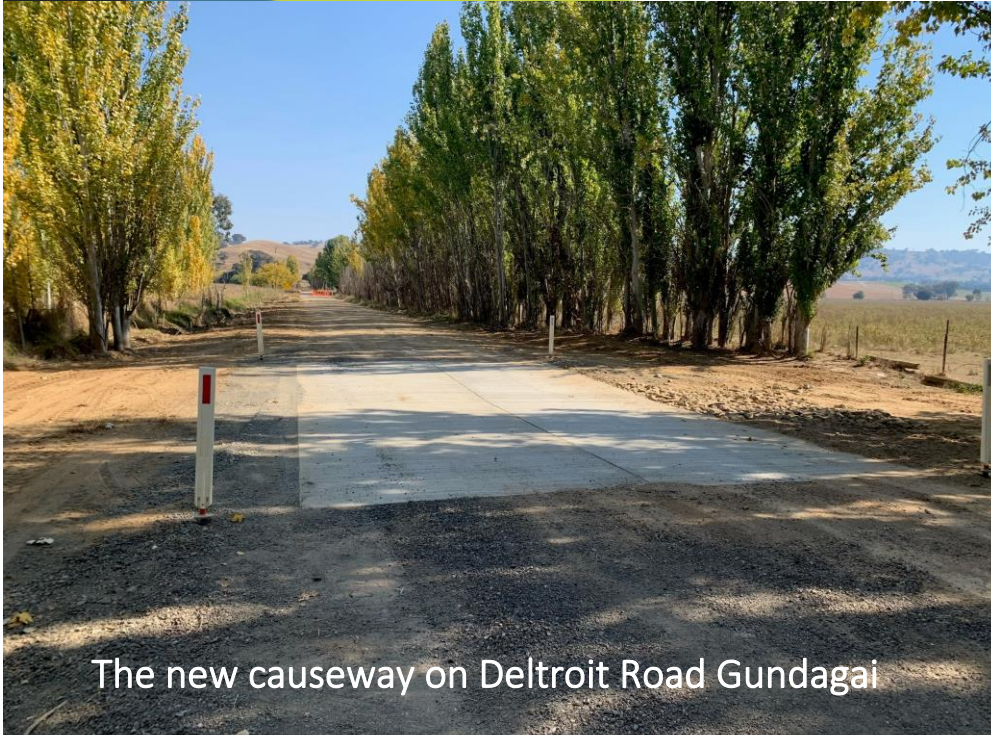
The new causeway on Deltrioit Road Gundagai