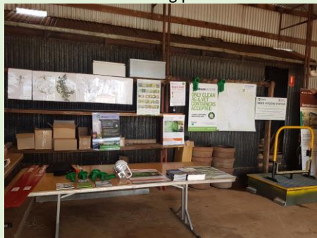
A host of information was on hand at the Weed Information Day held at Cootamundra Sale Yards on 27 March 2021

Overall a very successful day, with a BBQ and refreshments being provided.