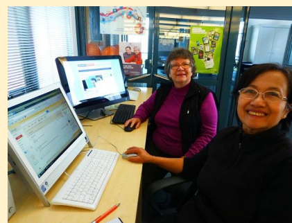
Free computer training courses for beginners will commence with a four-week course in Adjungbilly in November.

To register or enquire, phone the Cootamundra Library on 1300 459 689.