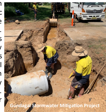
Gundagai Stormwater Mitigation Project