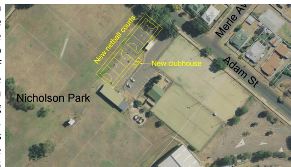
Proposed new netball courts location

New Netball Courts for Cootamundra —Council proposes to construct two new netball courts in Nicholson Park using part of the funding supplied for that purpose under the Stronger Country Communities Fund (Round 2). The development will provide two courts compliant with current safety standards, complete with competition standard lighting and a small clubhouse. The location of the new courts is on the site of the current courts, with some minor enlargement to accommodate safe run-off areas. A plan showing the footprint can be found on Council's website or by visiting the Cootamundra office. Written comments on Council's proposal are invited and will be received until 4pm Monday 3 June 2019.