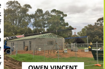
OWEN VINCENT OVAL

Additional works included staff cleared a large fallen tree branch in Jubilee Park that took out power lines. Staff set up road barriers for 4 causeways in Cootamundra in preparation for water over the roads. The flag pole was removed from the Parker/Wallendoon Street roundabout for the Christmas tree installation. Irrigation repairs were carried out at Bradman Oval. Construction of the new amenities building Owen Vincent Oval continues with block work completed and roof trusses installed. It is expected that the building will be to lock-up stage prior to Christmas. Gundagai Library / Mirrabooka Centre retaining wall is currently under construction and will be completed by mid-December.