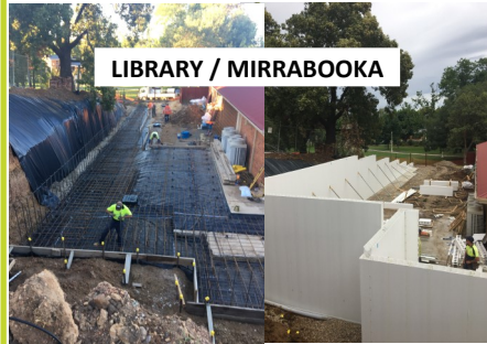
LIBRARY / MIRRABOOKA

Gundagai Men's Shed Retaining Wall is now in place. Stage one being installation of the lower walls has been completed. Stage two will include drainage and completion of the higher walls.