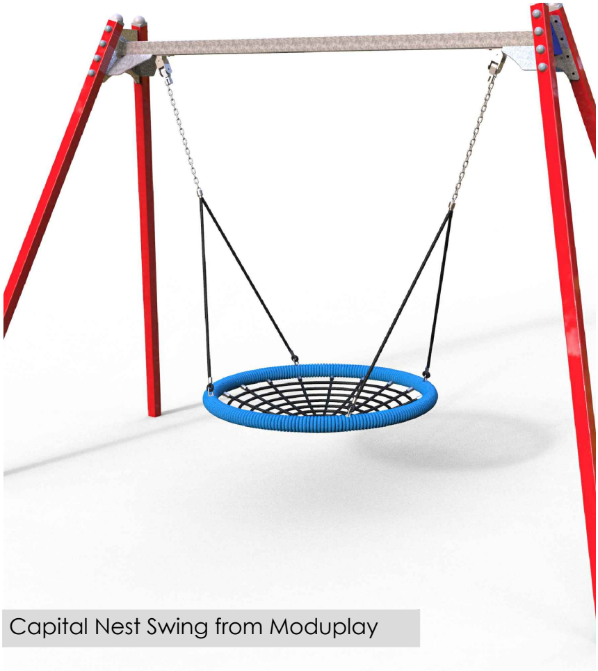
Capital Nest Swing from Moduplay