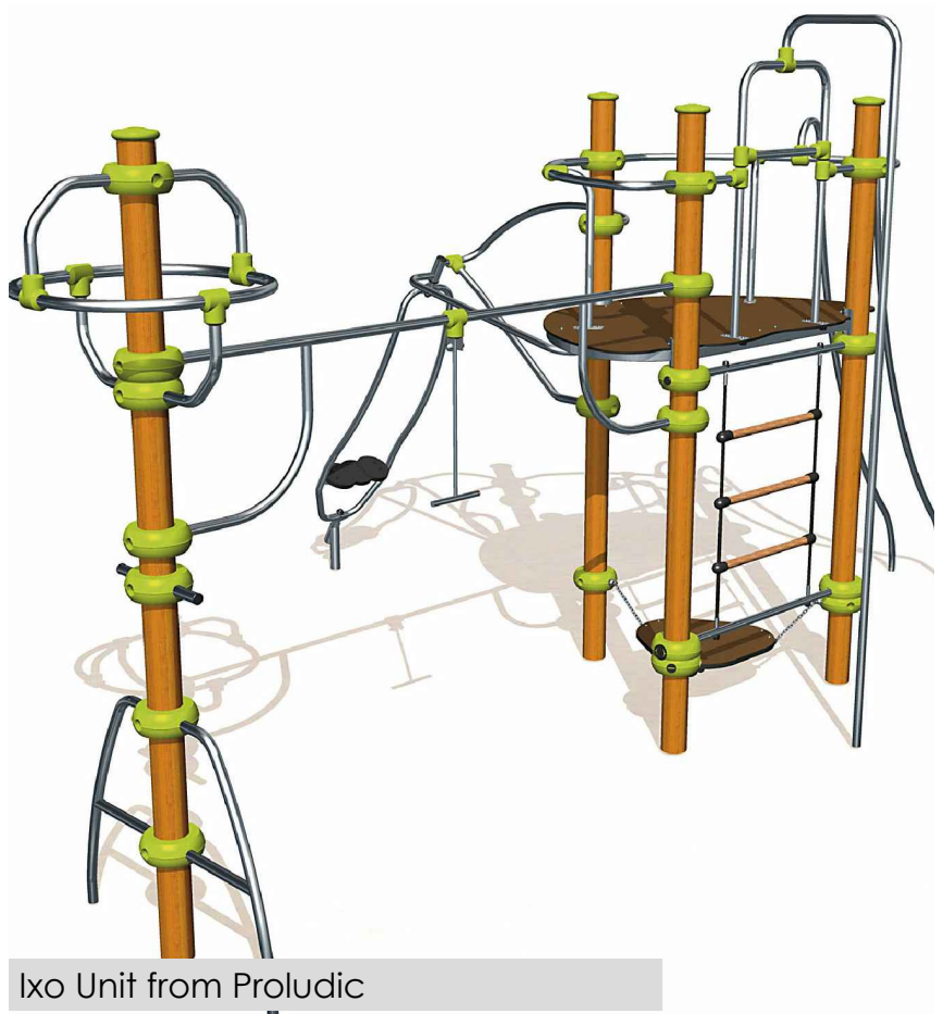
Ixo Unit from Proludic