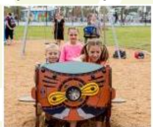
Fig 2.1h Grafic GamesJet