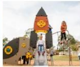
Fig 2.1g Tema Metropolis