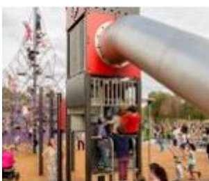
Fig 2.1a Custom Tower