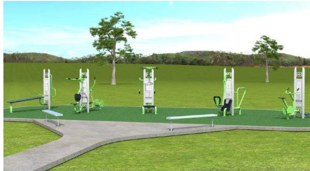
Fig 1.2 Concept Model equipment for Yarri Park