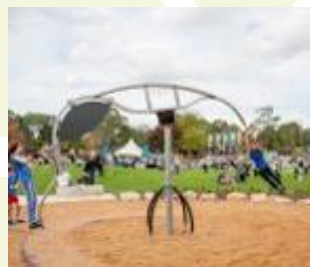
Fig 2.1c Skysurf