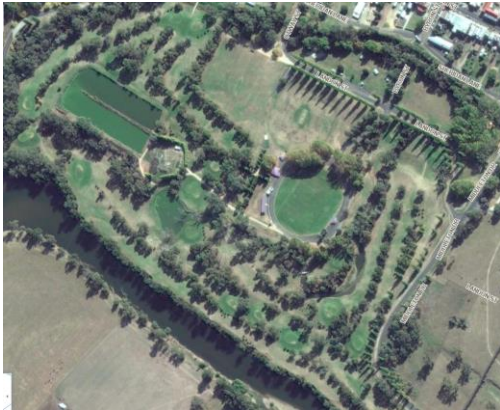
Fig 1.1 Location map- Possible Locations of exercise Equipment - along Yarri Park & along Murrumbidgee rive bank at Gundagai