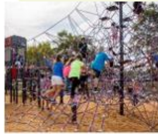
Fig 2.1b Galaxy Net