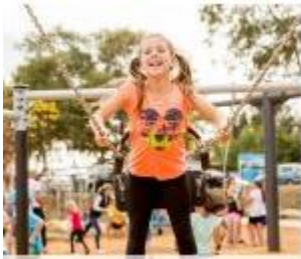
Fig 2.1e Hexagonal Swingset