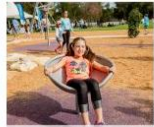
Fig 2.1f Infinity Bowl