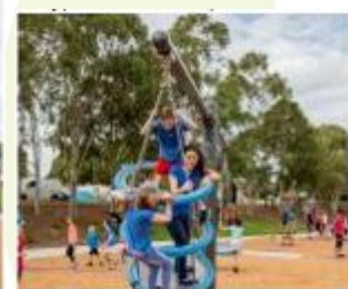
Fig 2.1d Trovni Swing