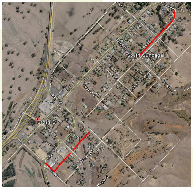
Fig 1.4 Proposed drainage replacement/extension at South Gundagai