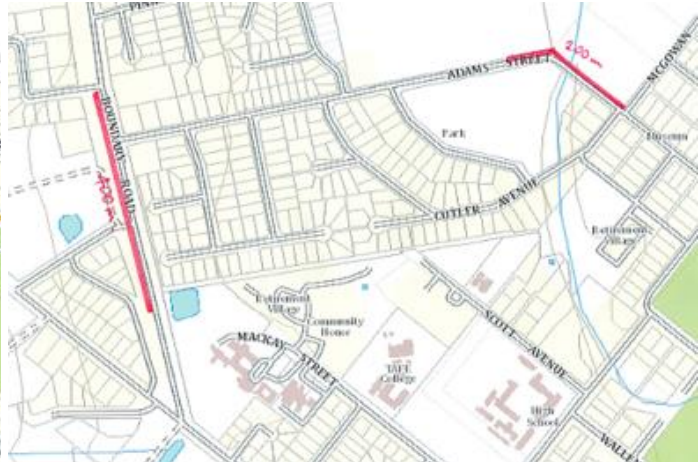
Fig 1.2 Proposed extension/renewal of sewer @ Adams St & Boundary St