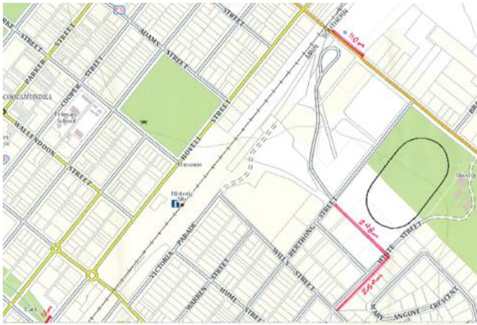
Fig 1.1 Proposed extension/renewal of sewer @ Temora St, White St, McConaghy St & Hovell St (Ck Outlet)