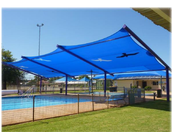
Fig 1.1 Proposed Straight Cantilever Pool Shade