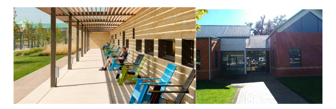
Fig 1.1 Concept Design-Steven Wards Outdoor room reading porch outside the Library in provides respite and a space for reading and reflection.