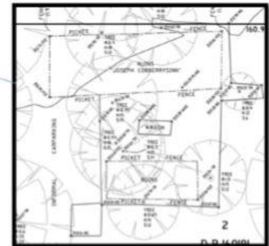
Archaeological Site (Limestone Inn) has been described in the 2006 Heritage Study however not listed as an item of local significance.